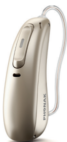
Phonak CROS P-13