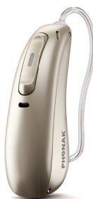
Phonak CROS P-R

For your good ear, you can pair with an Audéo P-13, P-R or P-RT hearing aid.